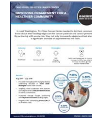
Tri Cities Cancer Center