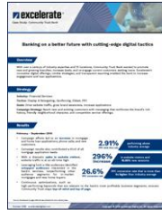
Community Trust Bank