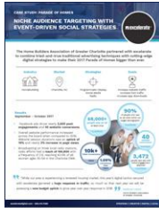
Charlotte Parade of Homes