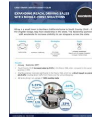
South County Chrysler