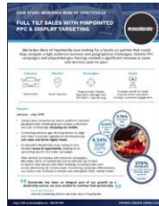
Mercedes-Benz of Fayetteville